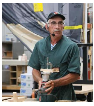
A small fence attached directly to the router base