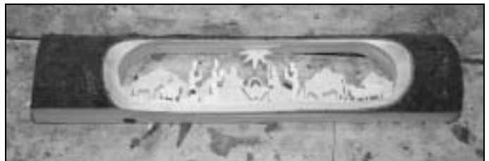
For this Nativity, Clem first cut the board into three layers and a different design was scrolled into each layer. The layers were then clued back together.