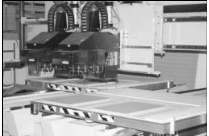
Caseworks' newest, computer-controlled, multi-head dual router is capable of changing profiles automatically. The raw material is loaded onto the bed and the finished product is pulled off. The machine can also be serviced on-the-fly; bits can be replaced as the machine continues to work.

with other businesses, they are able to use their large machines to rapidly create many engineered wood components used in the office furniture and store fixtures industries. Varying with demand, they maintain around 40 employees. As well as a full first shift, they run 7-10 people on a second shift.