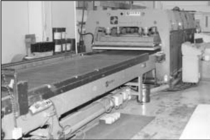
Caseworks' laminate press can process 400 sheets of wood in a 10 hour shift.

Custom Caseworks uses the latest technology to produce large volumes of high-quality wood products. Working