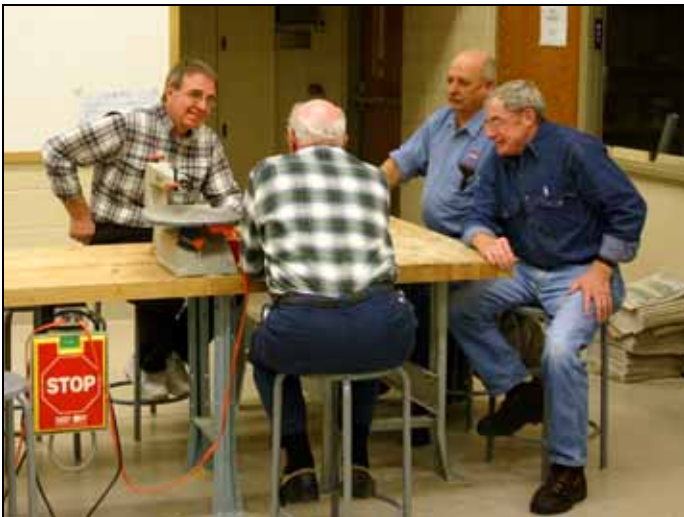
Many members swapped woodworking stories.