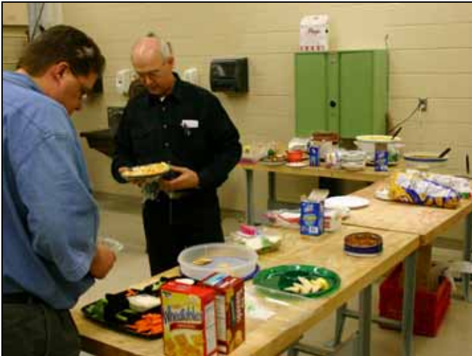
There were three full tables of food. Plenty to eat for everyone.

Last month's meeting was our annual holiday party. It was a great opportunity for woodworkers to get to know each other better and share some holiday food.