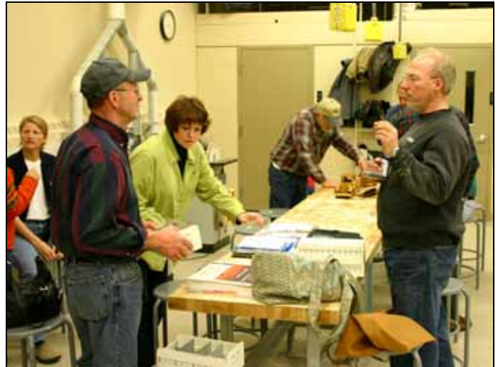
It was also an opportunity for members to pay their 2006 dues.