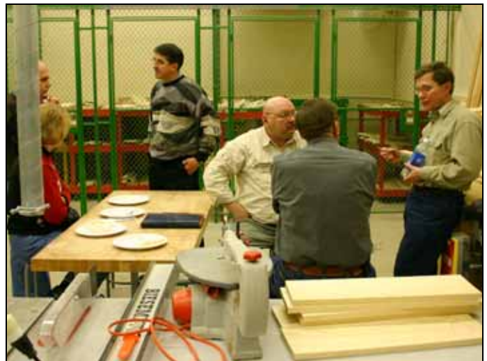
Members and significant others filled the Sauk Rapids-Rice Middle School wood shop.