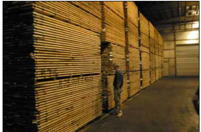
The St. Cloud Facility can dry hundreds of thousands of board feet of green lumber in their kilns.