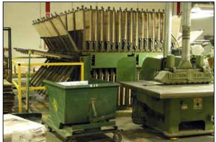
Woodcraft has many specialized machines like this clamping station.