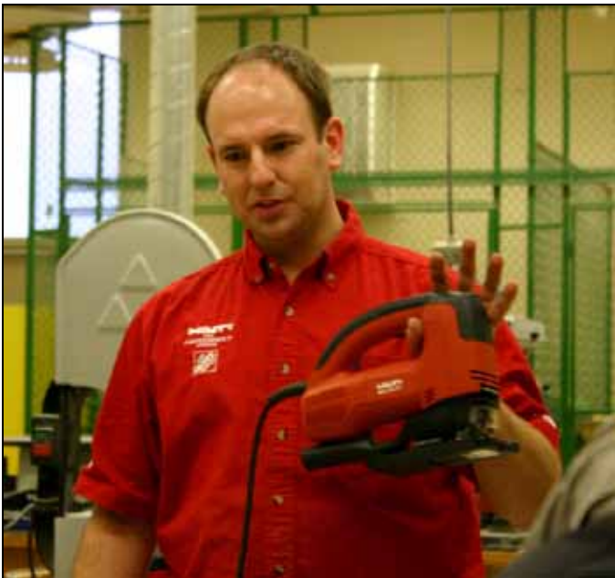
Greg also showed off Hilti's WSJ 850-ET Orbital Action Jig Saw.

Hilti is a long established European company located in Lichtenstein (near Germany). Hilti has now expanded into the cordless tool market as well and manufactures many quality commercial grade tools.