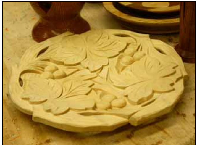
Intricate leaves decorate this detailed carved plate knifed by Alex Neussendorfer.