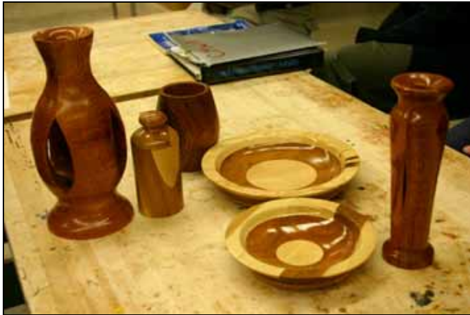
Dick Beumer's latest wood turnings show his ability to craft beautiful, unique pieces.