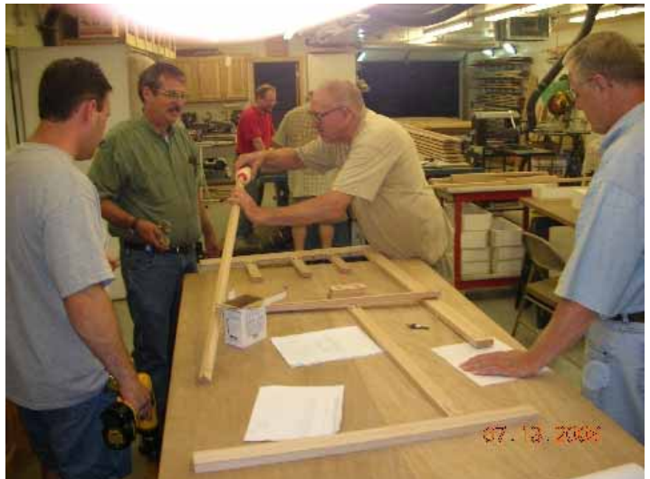
The Thursday night crew glues up cabinet face frames.