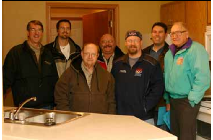
A few of the many hardworking woodworkers who helped on the Habitat for Humanity House.

Thanks again to all who made it possible.