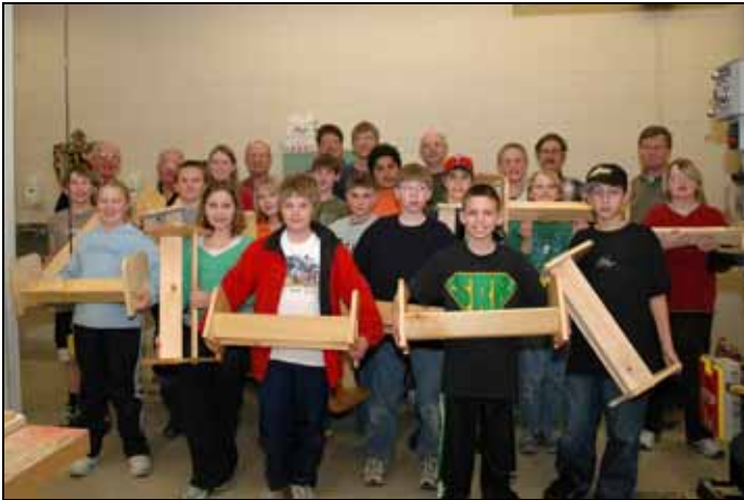
There were 17 students and many volunteers who participated.

Thank you to all the CMWA members who participated.