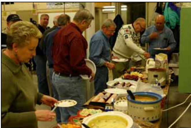
There was plenty of food at this year's event.