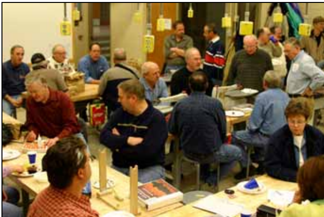
The woodshop was standing room only.