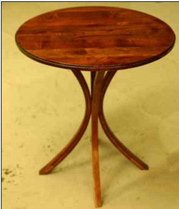
Eldred Schreifels made this cherry table.