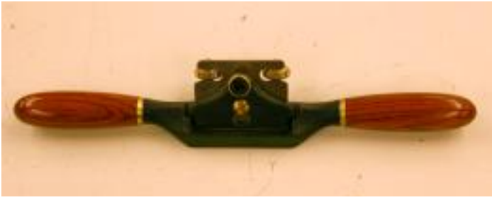
Scott Beatty brought a Veritas Spokes have to display