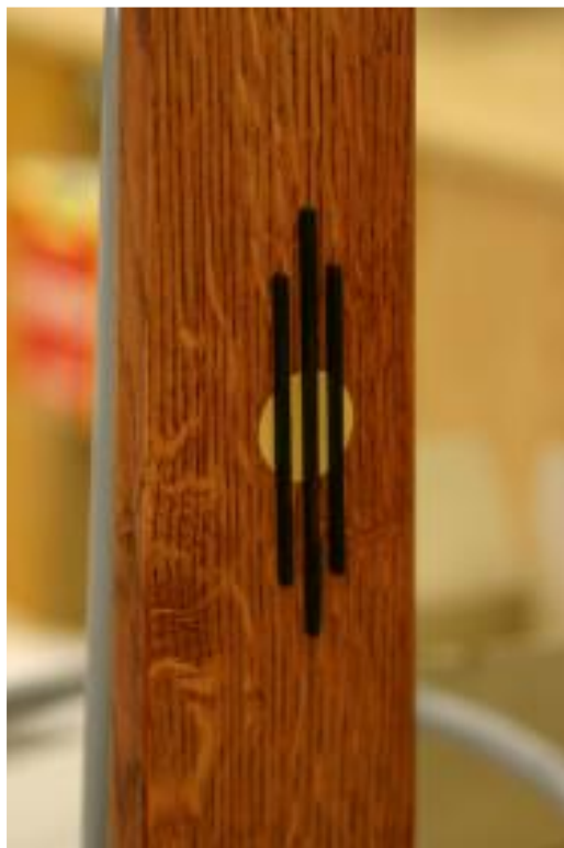
Here you can see the ebony detail that Scott included on each side of the mirror frame.