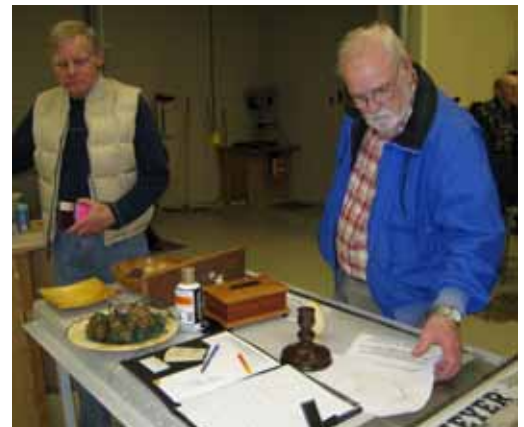
Members look over the show and tell items

We'd like to welcome seven new members to the CMWA this month. Please welcome the following new members: