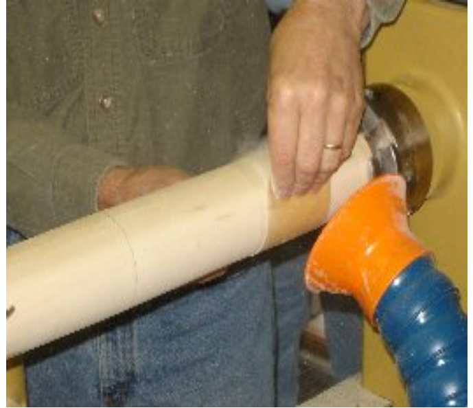
The Woodturners keep it going round this week by discussing their sandpaper experiences.