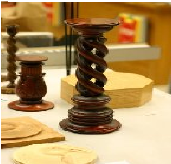
A candle holder turned on Brad's mill.