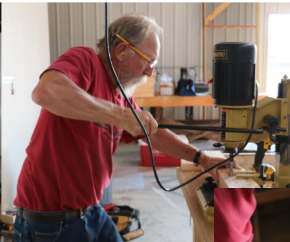
Legs are mortised and drilled for joining to the stretchers