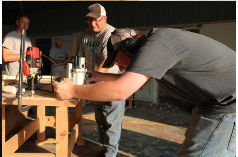
Cutting the bench tops to length and routing the top to mount the two face vices.