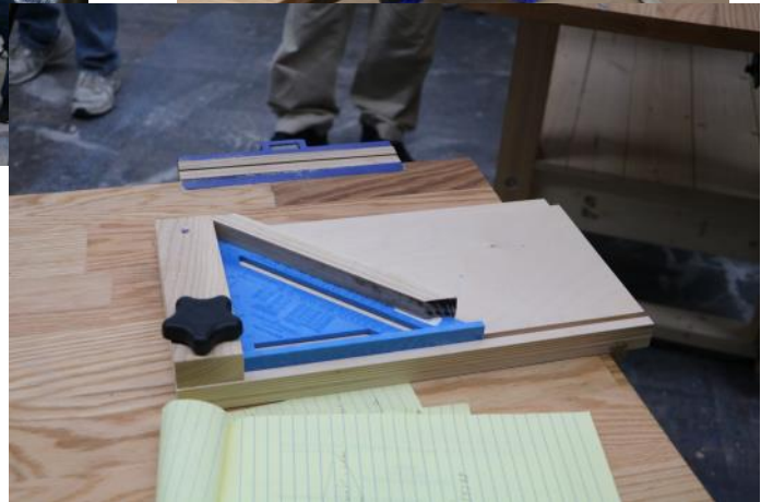
Completed Shooting Board